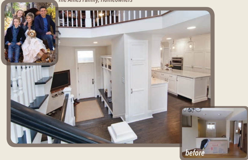
The Ames Family, Homeowners