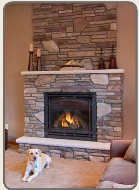
Even Marley the family lab is enjoying the new living spaces