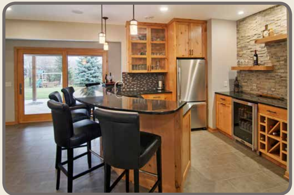
The modern bar downstairs provides a comfortable gathering place