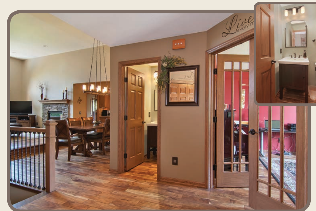
The addition allowed for a new music room, half bath, and large living spaces