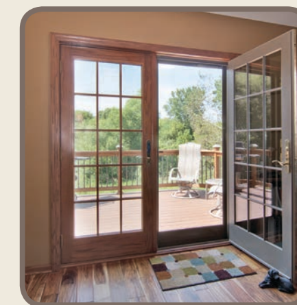
The backyard is highlighted with a new composite deck.