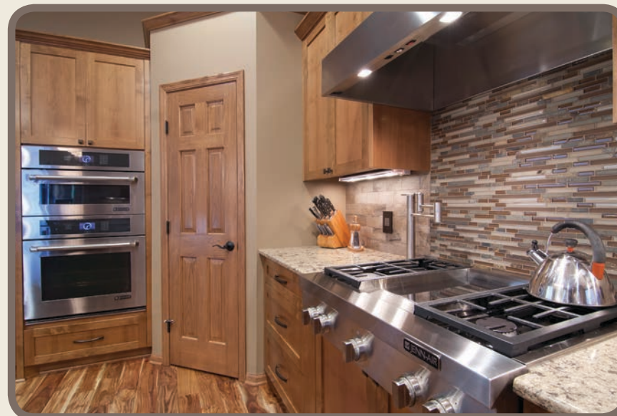
The inviting new kitchen features rich wood and plenty of space

Once constructed, the roomy addition allowed for confining interior walls to be replaced with open areas that highlighted the home's vaulted ceilings, improved the flow of the main level, and provided ample space for entertaining.