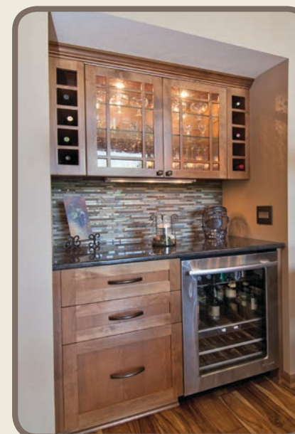
An elegant bar complements the kitchen and dining areas

The homeowners love their large dining area in the newly opened-up living area! The now-empty front area of the home became Phil's music room, accented with bold red walls and large windows. A half bath was conveniently located between the music room and dining area.