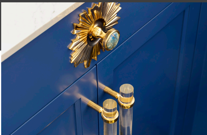
Custom Modern Matter brass cabinet hardware brings this design to life.